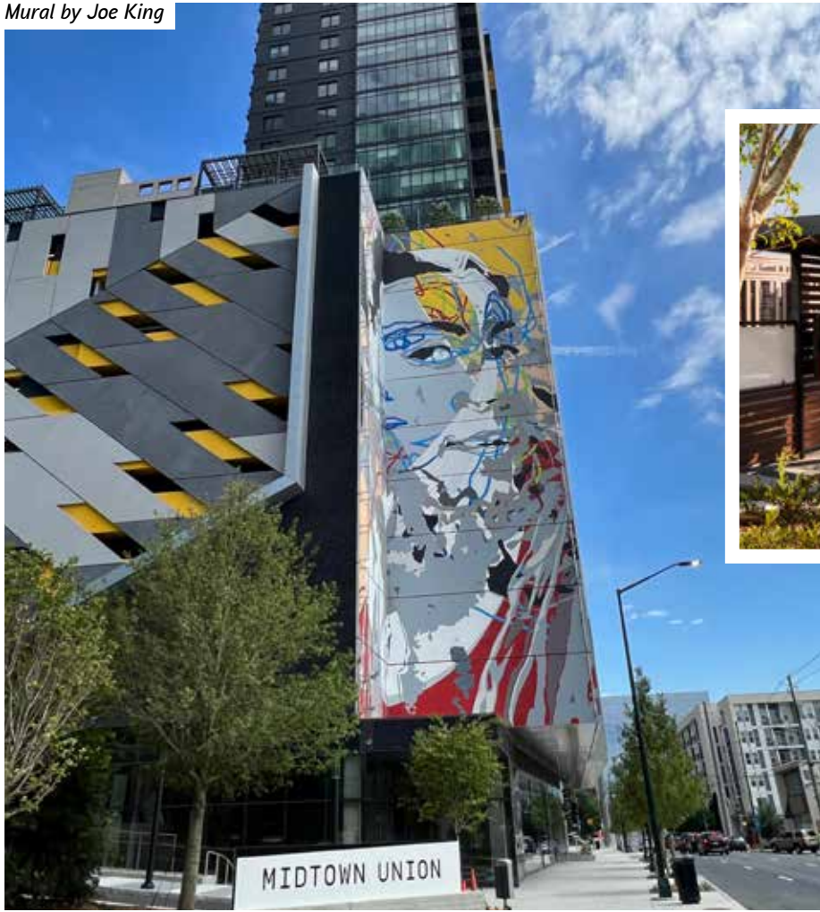
Mural by Joe King